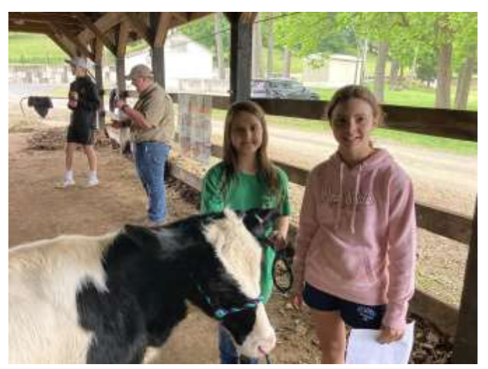
Learning stations were set up all over the grounds to teach many topics - animal husbandry, environmental issues, safety, etc.