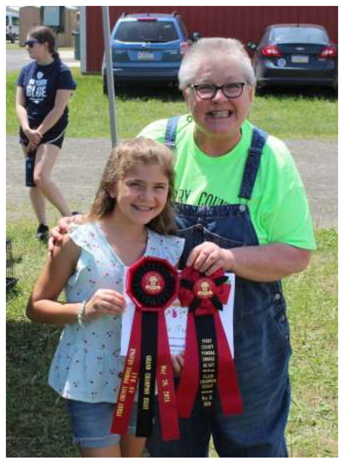
The theme of the annual essay & poster contests was "Feeding Our Families, Community & World". Awards were given to classroom winners & county champions.