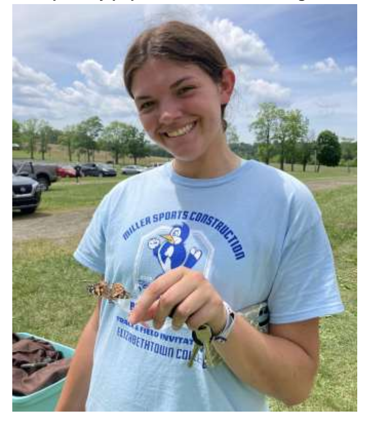
Ag Day is sponsored by the Pomona Grange for elementary students. Financial support came from many other groups & businesses; the learning stations are planned/managed by Perry County FFA members.