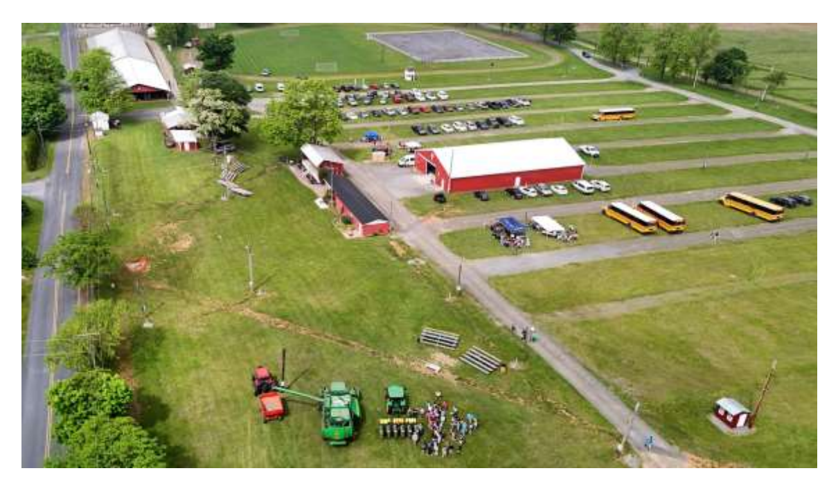
An aerial shot of Perry County Fairgrounds in Newport where many activities take place throughout the year, including the Pomona Grange Ag Day in May and the annual fair in August.