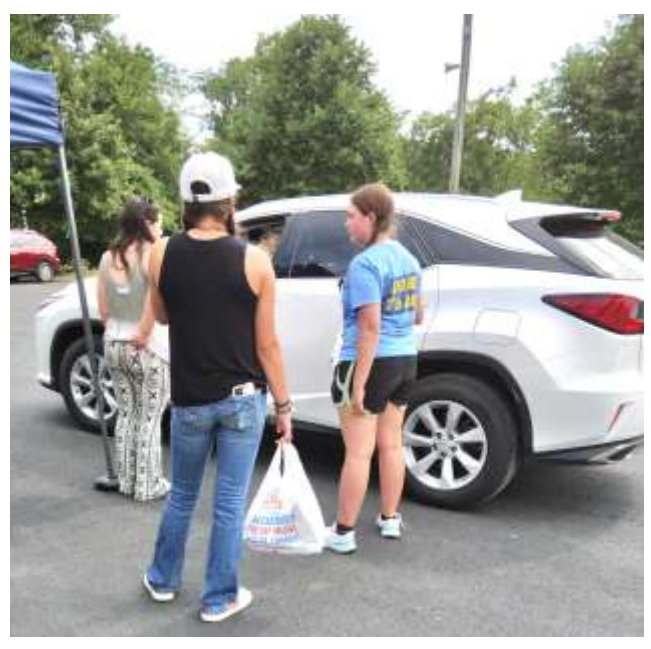
Meals were filled in two serving lines and quickly delivered as each car pulled up.